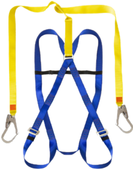
Safety Harness With Scaffold Hook (6049) D.LANYARD SCAFFOLD HOOK SABS APPROVED