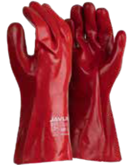
PVC Medium Weight Gloves - 45cm (2094) COTTON STOCKINETTE LINER • SAFETY CUFF