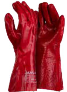
PVC Extra Heavy Weight Gloves - 35cm (2052) COTTON TOWELLING LINER ROUGH FINISH • SAFETY CUFF