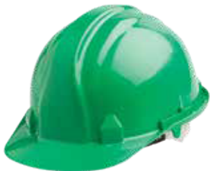
Jockey Type Hardhat (6035) HDPE INDUSTRIAL 6 POINT HEADGEAR LDPE LINER WITH 2 STAGE HEIGHT ADJUSTMENT STANDARD SIZE • ASSORTED COLOURS