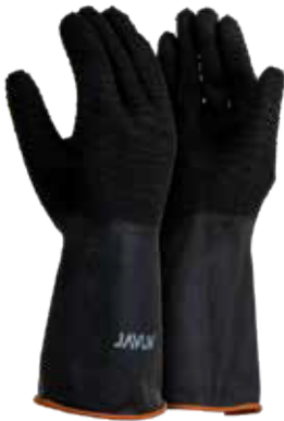
Industrial Rough Palm Rubber Gloves Elbow Length (2015) ORANGE LINER • CRINKLE FINISH ON HAND • SMOOTH FINISH ON CUFF