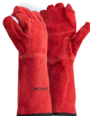
Premium Red Leather Blanket Lined Heat Gloves 20cm Cuff (2011R) RED AB GRADE SPLIT COW LEATHER STANDARD FIVE FINGER PATTERN APRON PALM • KEVLAR THREAD