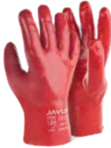
PVC Medium Weight Gloves - 27cm (2005) COTTON STOCKINETTE LINER • SAFETY CUFF