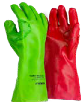
PVC Red Left Hand, Green Right Hand Reinforced Safety Cuff Miner's Gloves - 35cm (2117)