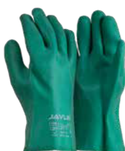
Foam PVC Fluorescent Green Sandy Finish Gloves (2096) COTTON INTERLOCK LINING