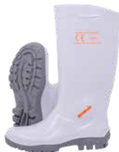
White/Grey Oil & Acid Resistant Gumboot (NEP4001-WG)