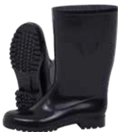
Women's Black Calf Length Gumboot (NEP4002-BB)