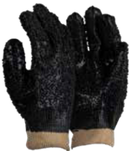
Premium Black Chip PVC Fully Granulated Gloves (2037) COTTON STOCKINETTE LINER GRANULATED BLACK CHIPS BACK & FRONT • KNITTED WRIST