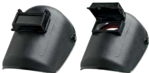
Flip Front Welding Helmet (6012) RATCHET HEADGEAR • CLEAR LENS 1MM CLEAR POLYCARB DEEP LENS