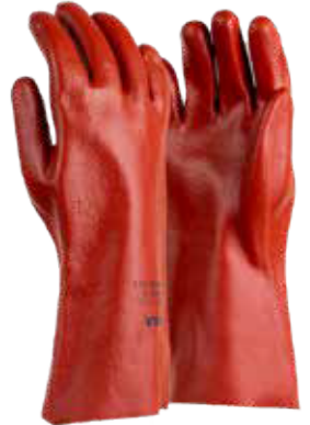
PVC Red/Brown Elbow Length Gloves - 40cm (2105)