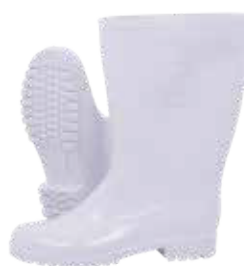
Women's White Calf Length Gumboot (NEP4002-WW)