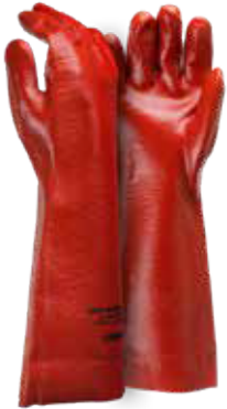
PVC Shoulder Length Gloves - 60cm (2102)