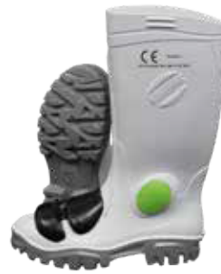
White Knee Length Heavy Duty Metaguard Steel Toe & Midsole Gumboot (NEPSPML02-WH)