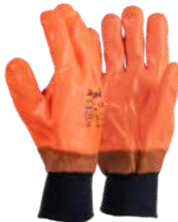
Orange PVC Freezer Knit Wrist Gloves (2024) THERMOPLASTIC PVC • COTTON, FOAM & JERSEY LINING • SMOOTH FINISH • KNITTED WRIST