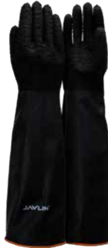
Industrial Rough Palm Rubber Gloves Shoulder Length (2055) ORANGE LINER • CRINKLE FINISH ON HAND • SMOOTH FINISH ON CUFF