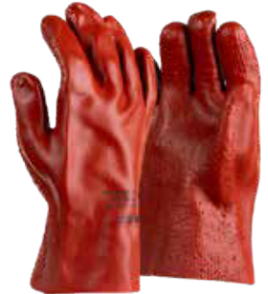
PVC Heavy Weight Rough Palm - 27cm (2112)