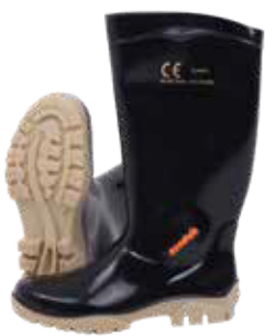
Black/Ivory Knee Length General Purpose Gumboot (NEP4001-BI)