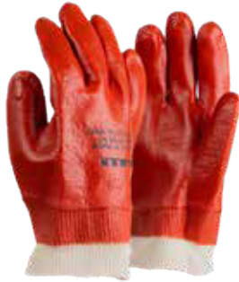
PVC Medium Weight Red/ Brown Knit Wrist Gloves (2103)