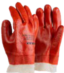
Chemical And Acid PVC SABS Gloves Knit Wrist (2123)