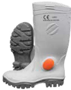
White/Grey Knee Length Heavy Duty Steel Toe Gumboot (NEP4003-WG)