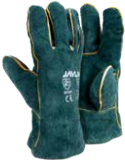
Green Leather Fully Welted Lined Gloves 6cm Cuff (2009) COW SPLIT LEATHER GAUNTLET • WING THUMB