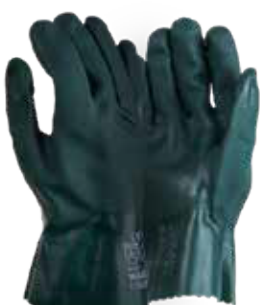
Green PVC Double Dipped Sandy Finish Gloves 27cm Cuff (2035) COTTON JERSEY LINER