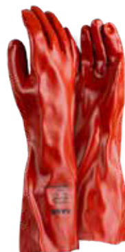
Chemical And Acid PVC SABS Gloves - 40cm (2125)