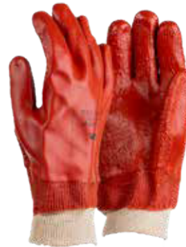
PVC Heavy Weight Rough Palm Knit Wrist (2111)