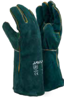
Green Leather Fully Welted Lined Gloves 15cm Cuff (2056) COW SPLIT LEATHER GAUNTLET • WING THUMB