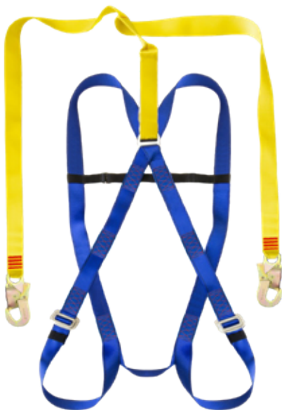
Safety Harness With Snap Hook (6048) D.LANYARD SNAP HOOK SABS APPROVED