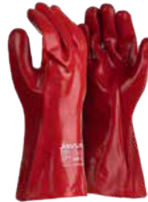
PVC Medium Weight Gloves - 35cm (2007) COTTON STOCKINETTE LINER • SAFETY CUFF