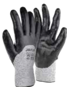
Cut 5 Liner ¾ Nitrile Coated Gloves (2041) 13G CHINEEMA FIBRE ¾ DIPPED NITRILE KNUCKLE WITH HEAT TRANSFER PRINT