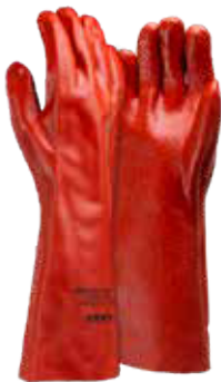
Pvc Heavyweight Rough Palm Gloves - 35cm (2113)