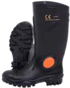
Black Knee Length Heavy Duty Steel Toe Recycled Gumboot (NEP4003-BB)