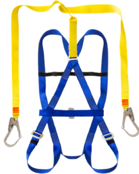
Safety Harness Belted, Energy Absorber, Double Lanyard & Scaffold Hooks (6068) SABS APPROVED