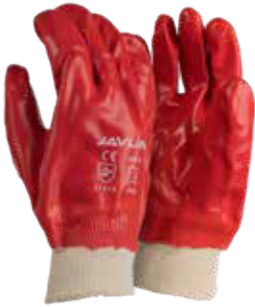
PVC Medium Weight Knit Wrist Gloves (2006) COTTON STOCKINETTE LINER • KNITTED WRIST