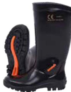
Black Knee Length General Purpose Gumboot (NEP4001-BB)