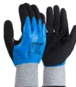
Cut 5 Liner Level F Nitrile Coated Gloves (2075) FULLY DIPPED SANDY NITRILE PALM WITH REINFORCING BETWEEN THUMB AND FOREFINGER