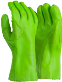
PVC Medium Weight Reinforced Glove Safety Cuff -27cm (2109)