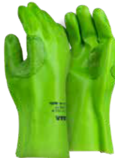
PVC Red Left Hand, Green Right Hand Reinforced Safety Cuff Miner's Gloves - 27cm (2116)