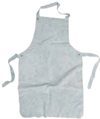
Chrome Leather Apron 60 x 90cm (LAPRON90) & Chrome Leather Apron 60 x 120cm (LAPRON120)