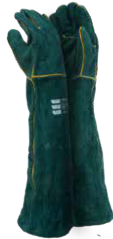
Green Leather Fully Welted Lined Gloves 40cm Cuff (2057) COW SPLIT LEATHER GAUNTLET • WING THUMB