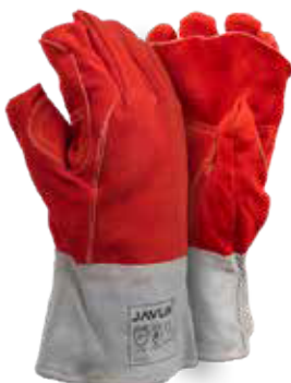
Premium Red Leather Heat Gloves 10cm Cuff (GLHR11) RED AB GRADE COW SPLIT LEATHER WELTED & PALM LINED • APRON PALM KEVLAR THREAD