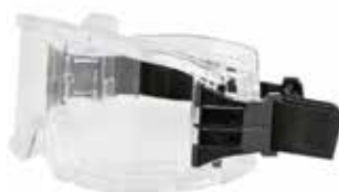
Wide Vision Anti-Scratch Goggles (6005AF) ANTI-SCRATCH & ANTI-FOG • CLEAR PVC FRAME WITH VENTS • OPTICAL CLASS 1 • MECHANICAL STRENGTH B(120M/S)