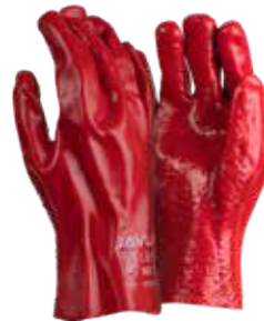
PVC Extra Heavy Weight Gloves - 27cm (2033) COTTON TOWELLING LINER ROUGH FINISH • SAFETY CUFF