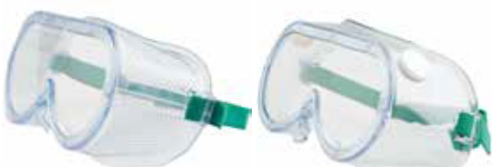
Direct Vent Goggles (6005CL) & Indirect Vent Goggles (6006CL) WIDE VISION POLYCARBONATE LENS PVC FRAME WITH VENTS • OPTICAL CLASS 1 MECHANICAL STRENGTH B(120M/S)