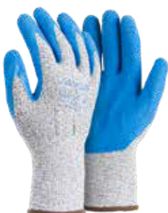
Cut 5 Liner Latex Coated Gloves (2072) CRINKLE LATEX COATED PALM • LIGHT WEIGHT HEAT RESISTANT EN 407