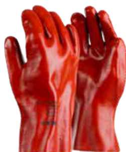
Chemical And Acid PVC SABS Gloves - 27cm 2124)