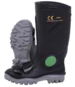
Black/Grey Knee Length Heavy Duty Metaguard Steel Toe & Midsole Gumboot (NEPSPML02-BG)