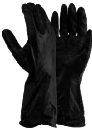
Black Latex Builders Gloves (2018) GRIP FINISH ON HAND SMOOTH FINISH ON CUFF FLOCK LINED