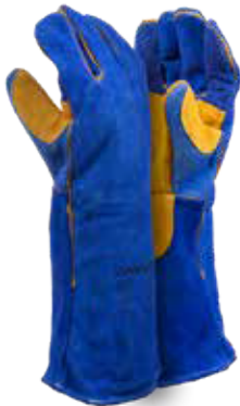
Premium Blue Leather Lined Welding Gloves 20cm Cuff (2043) BLUE A GRADE COW SPLIT LEATHER GAUNTLET • REINFORCED PALM & THUMB