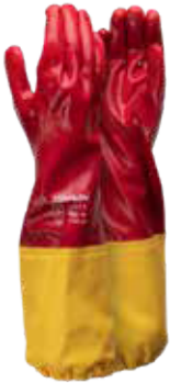
PVC Shoulder Length Gloves With Extension Cuff (2081) COTTON STOCKINETTE LINER • PVC ELASTICATED