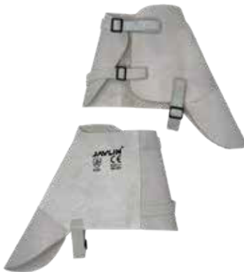
Chrome Leather Ankle Spats (SLANKL)