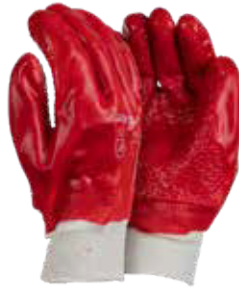
PVC Extra Heavy Weight Knit Wrist Gloves (2028) COTTON TOWELLING LINER ROUGH FINISH • KNITTED WRIST