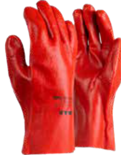
PVC Medium Weight Red/Brown Open Cuff Gloves - 27cm (2104)