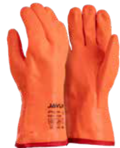
Orange PVC Insulated Freezer Gauntlet Gloves - 30cm (2095) THERMOPLASTIC PVC • COTTON, FOAM & JERSEY LINING • SANDY FINISH FOR GRIP