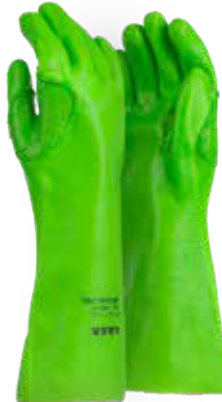
PVC Medium Weight Reinforced Gloves Elbow Length (2110)