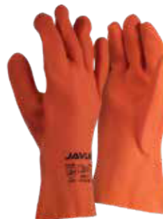
Foam PVC Fluorescent Orange Sandy Finish Gloves (2097) COTTON INTERLOCK LINING